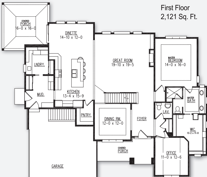
First Floor 2,121 Sq. Ft.