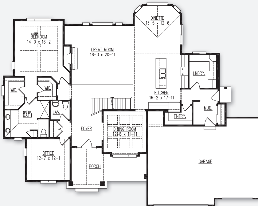
FIRST FLOOR 2,261 SQ. FT.