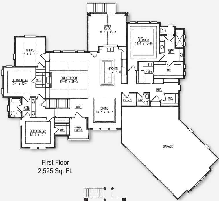
First Floor 2,525 Sq. Ft.