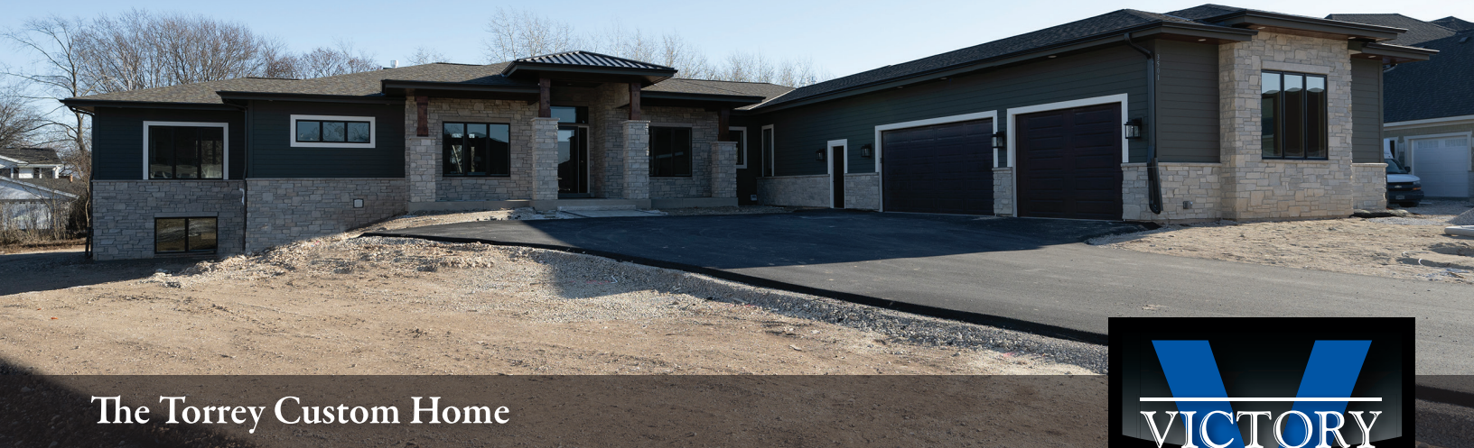
The Torrey Custom Home