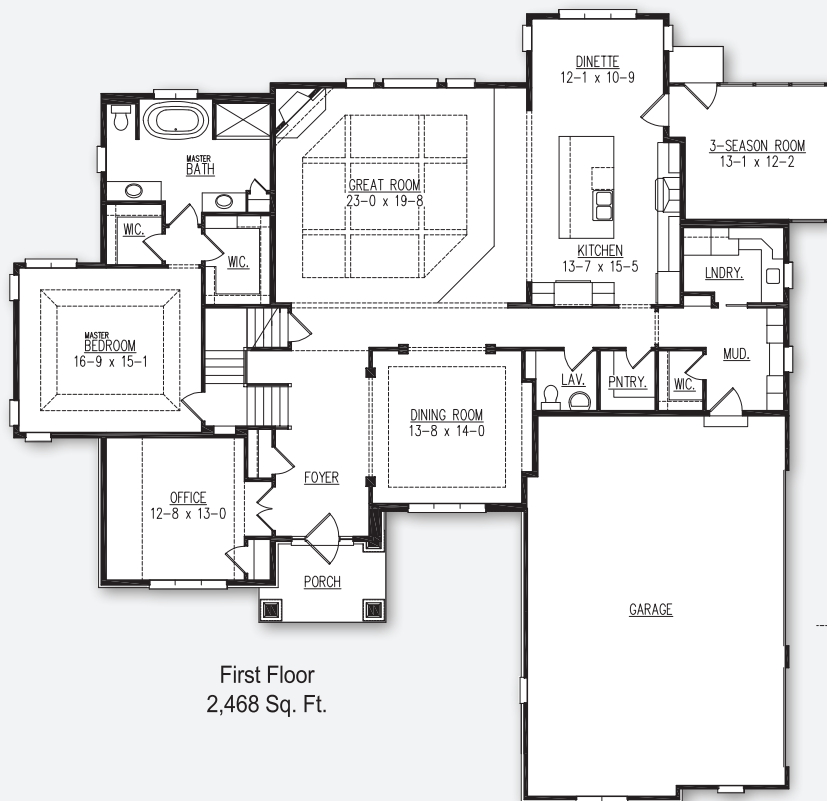
First Floor 2,468 Sq. Ft.