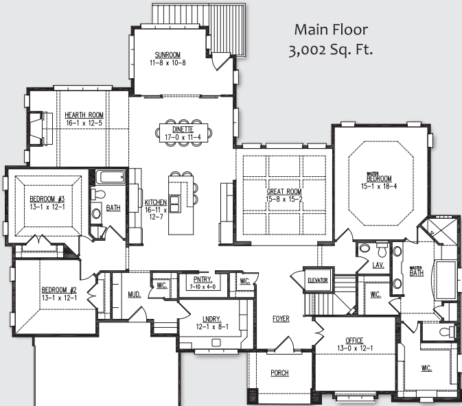
Main Floor 3,002 Sq. Ft.

Model Hours: Saturday & Sunday 12-4 pm, or by appointment. Closed holiday weekends.