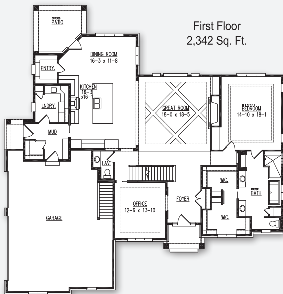
First Floor 2,342 Sq. Ft.